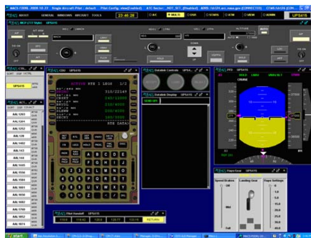
Figure 2. Multi-Aircraft Control System (MACS).

In addition to the CSD, pilots were provided with the Multi-Aircraft Control System (MACS; Prevot, 2002) which was displayed on a separate monitor. MACS provides an interactive display that simulates a 747 flight deck controls (Figure 2). These flight deck controls included the primary flight display (PFD), the mode control panel (MCP), data link display and controls for sending/receiving data link messages and new routes from the ground or automation, as well as flaps and gears for landing procedures.